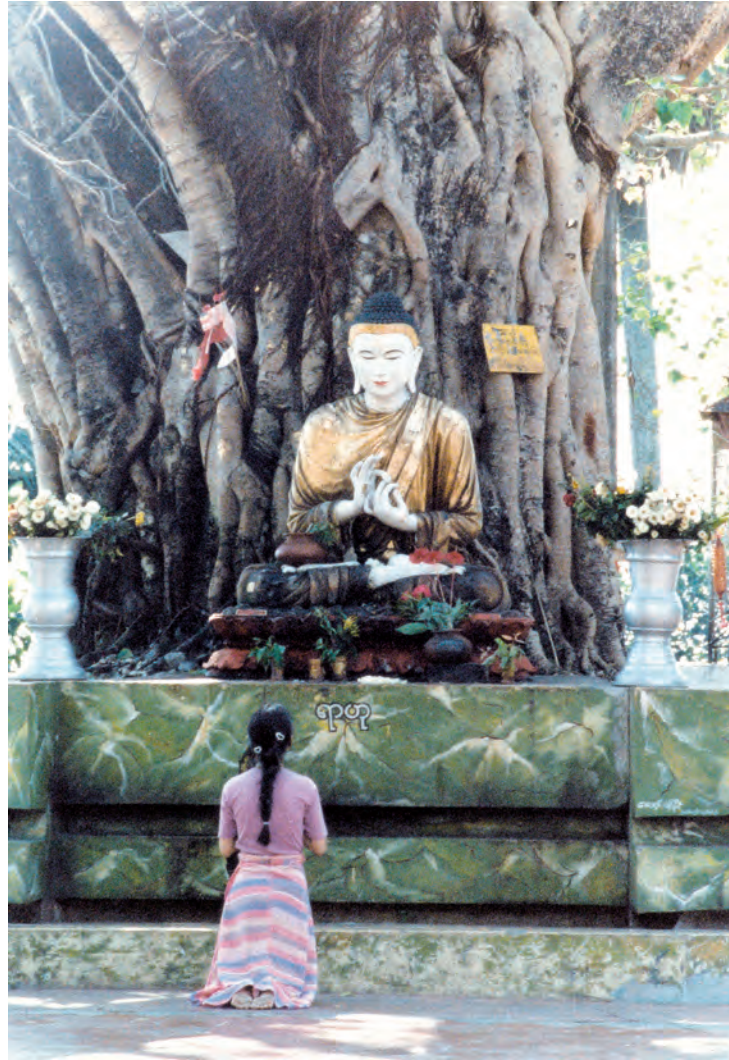
Master on a pilgrimage in Burma