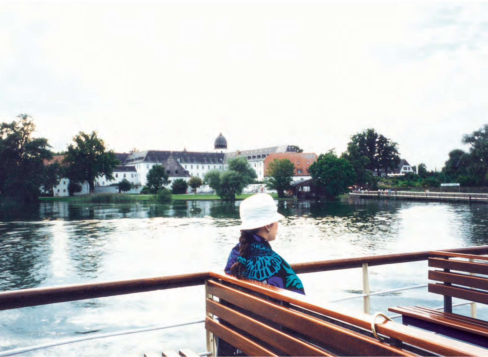
Supreme Master Ching Hai on the ferry near Herrenchiemsee, an island castle in Bavaria, Germany