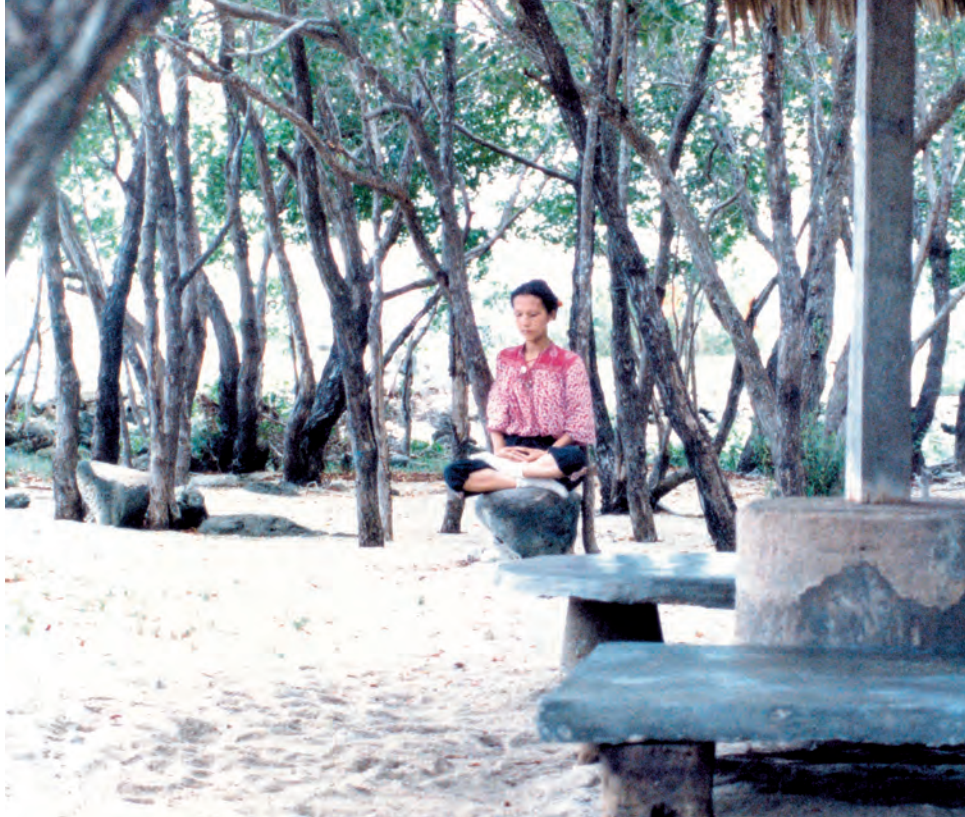
Master meditating on a pilgrimage in Thailand