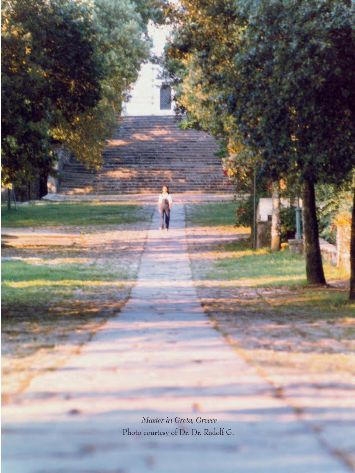
Master in Greta, Greece