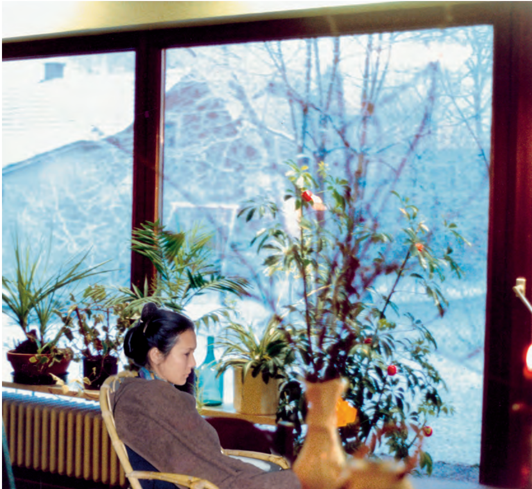
Master in Germany