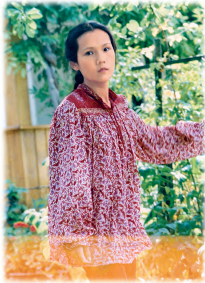
Master at Her parent-in-law's in Germany