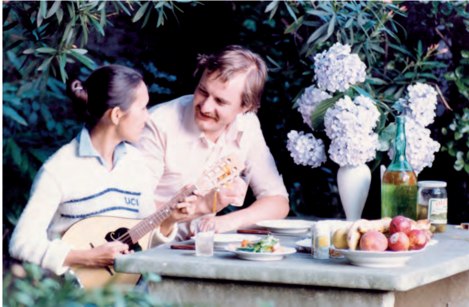
Master on honeymoon, Rapallo, Italy