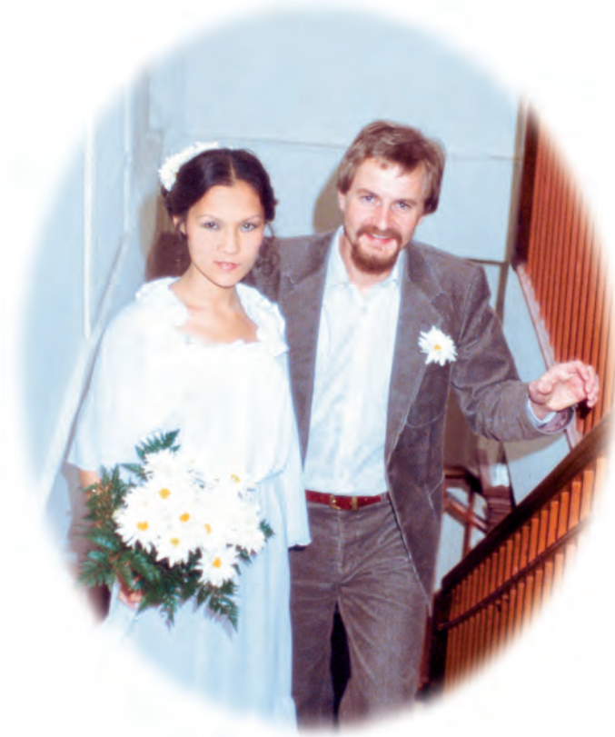
Master and Her husband on their wedding day