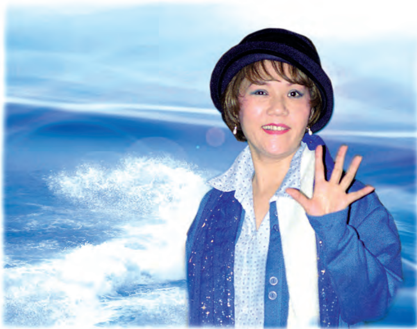
THE SUPREME MASTER CHING HAI