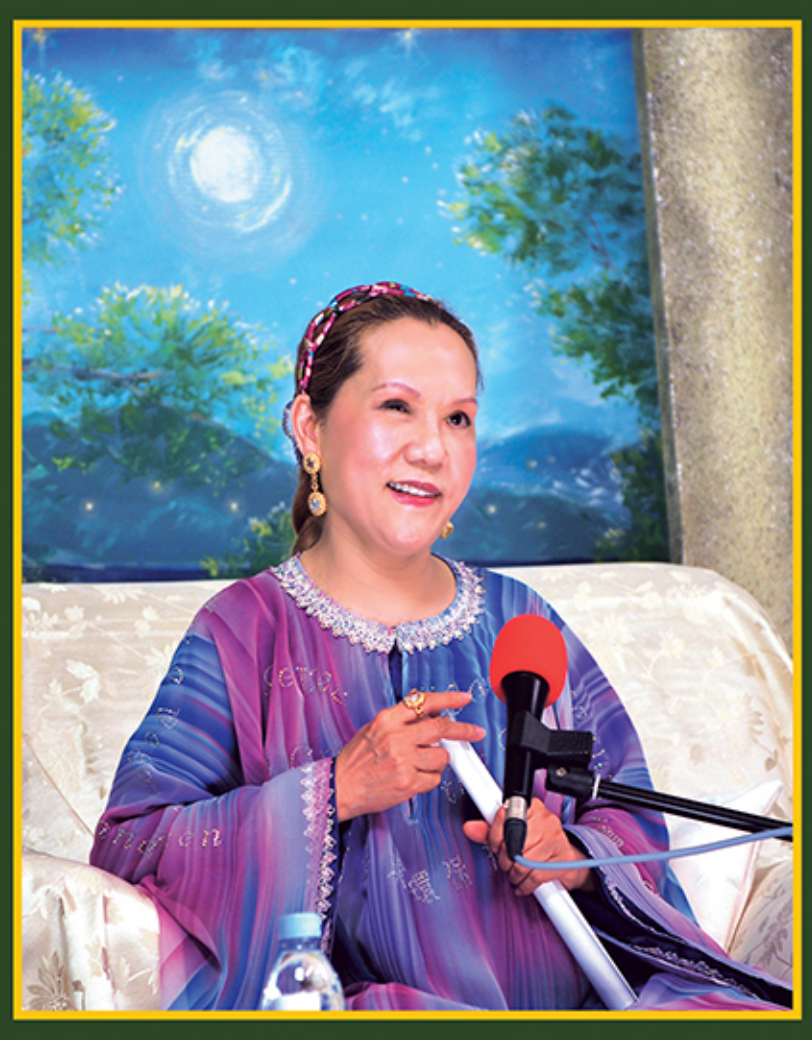
The Supreme Master Ching Hai